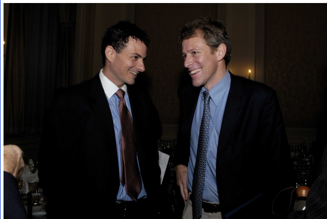
David Einhorn and Whitney Tilson