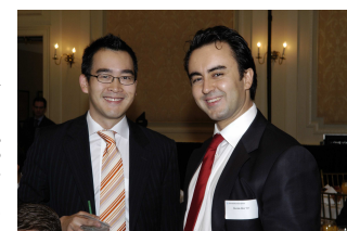
CBS alumni reconnect at the Graham & Dodd Breakfast

"The crisis came because we have a lot of bad practices and a lot of bad ideas."